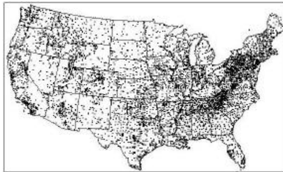
Figure 2. United States monitoring stations.

Currently, JAWF receives global and domestic weather data primarily through an established T-1 line connected to NCEP (Figure 3). The GOS data received at NCEP are decoded and summarized in a 24-hour data file that is sent to JAWF daily.